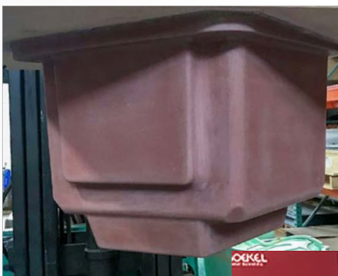
Figure 3: The SAYtooling System engineered mold solution