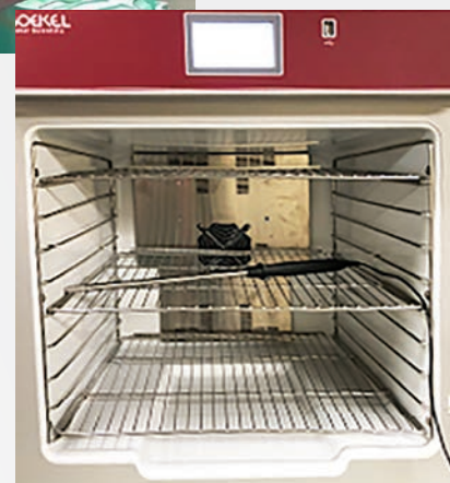
Figure 4: Incubator assembly with deep draw thermoformed liner