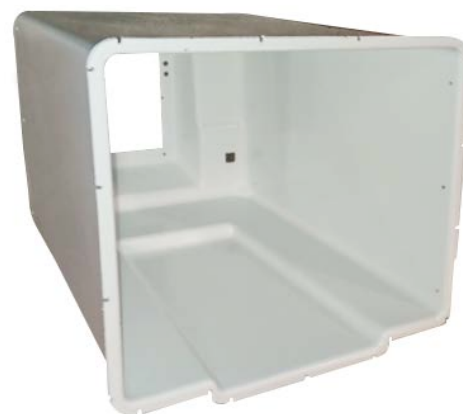
Figure 2: Thermoformed Kydex T (Acrylic/PVC) plastic conversion liner

SAY Plastics is currently putting their thermoforming and liner manufacturing expertise to work for another client. A key player in the small freezer market recognizes the advantages of SAY Plastics' deep draw capabilities and will soon be launching their liner conversion from stainless steel to thermoplastic. ■